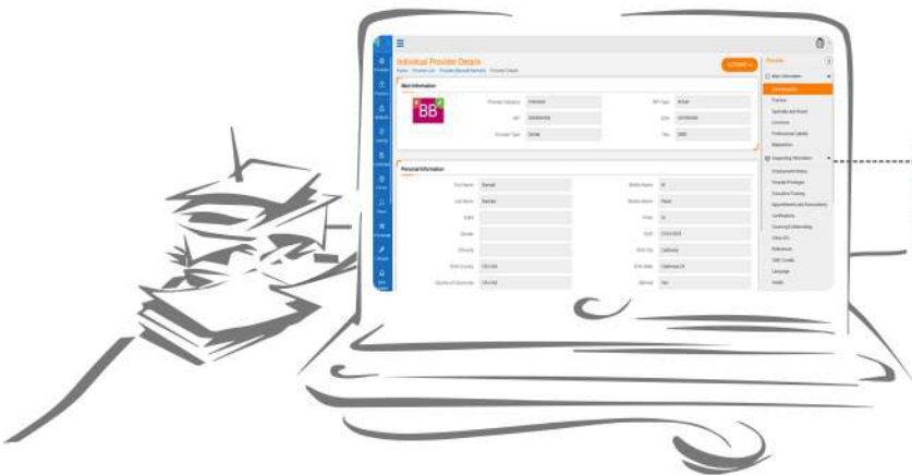
Colored dashboards instantly identify a file's status

I-Enroll is an intuitive and easy-to-use time saver for providers and their staff. It eliminates the need to track, store, and keep physical applications up to date. And its seamless and award winning integration to leading E-Signature solutions are yet another plus to consider.